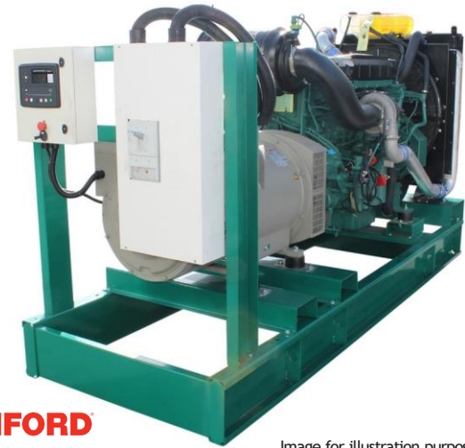
Image for illustration purposes only